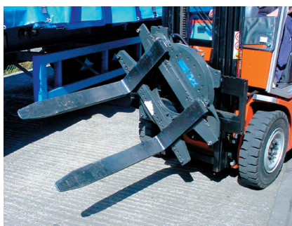
旋转器 T351 (Rotator)