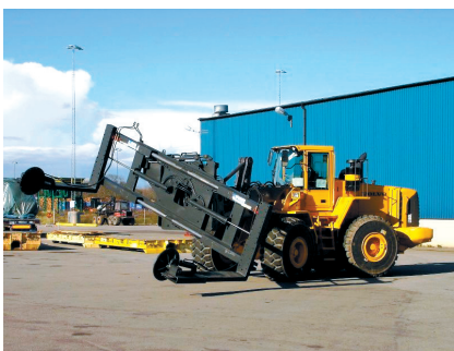
轮胎夹 T221SV (Tyre Handler)