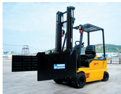
烟包夹 T413CT (Tobacco Bale Clamp)