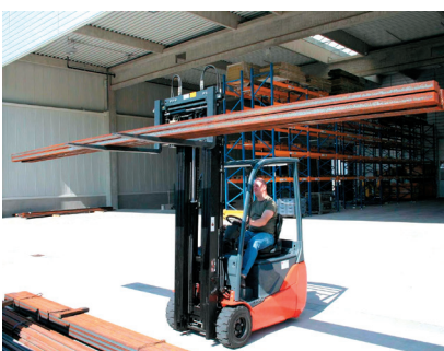
调距叉 T160 (Positioner)