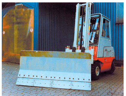
铲雪板 T198 (Snow Plough Blade)