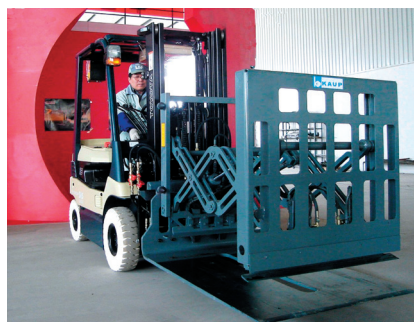
推拉器 T146 (Push-pull)