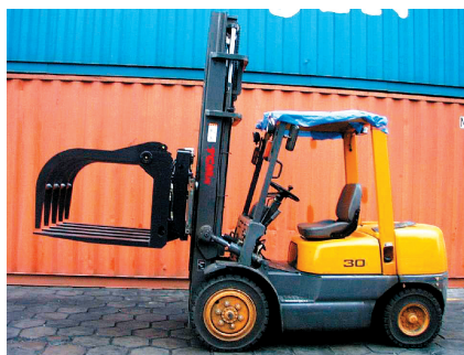
原木夹 T135 (Scrap Grapple)