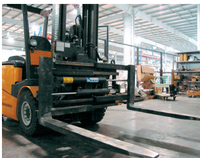
叉夹 T411 (Fork Clamp)