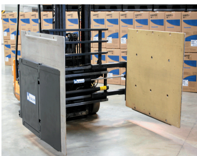
纸箱夹 T414-1 (Carton Clamp)