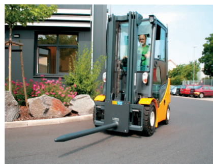
串杆 T185 (Carrying Ram)