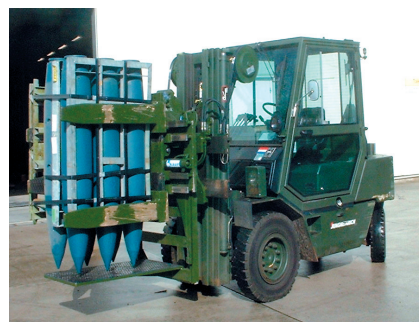
托盘转换夹 T451 (Pallet Turnover Clamp)