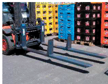
前伸叉 T180T (Telescopic Fork)