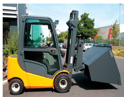
料斗 T184 (Bucket)