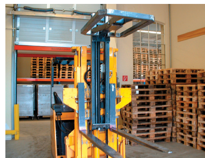
载荷稳定器 T129 (Load Stabilizer)