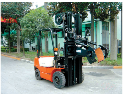
倒桶夹 T406 (Drum Tipping Clamp)