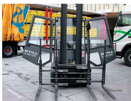
双托盘叉 T429 (Double Pallet Handler)