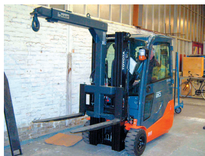
起重臂 T183 (Crane Jib)