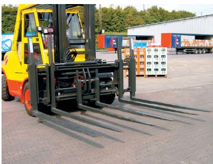
多托盘叉 T419 (Multi Pallet Handler)