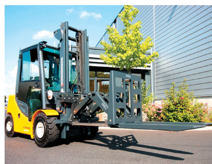
前移叉 T140SV (Reach Fork)