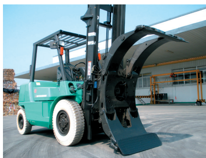
纸卷夹 T458 (Paper Roll Clamp)