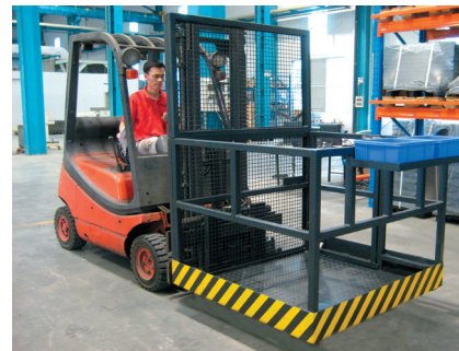
工作台 T197 (Working Platform)

KAUP 属具在质量、安全和设计方面均符合相关EC标准要求，并通过DIN EN ISO9001质量体系认证。