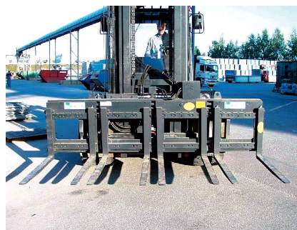
多侧移器 T254 (Multi Sideshifters)