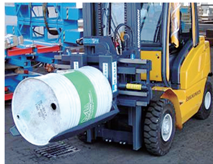
二用叉夹 T411D (Fork Clamp with Turnable Forks)