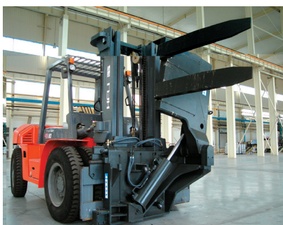
倾翻叉 T360 (Ladle Tippler)