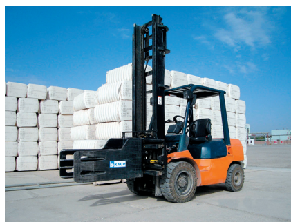
软包夹 T413 (Bale Clamp)